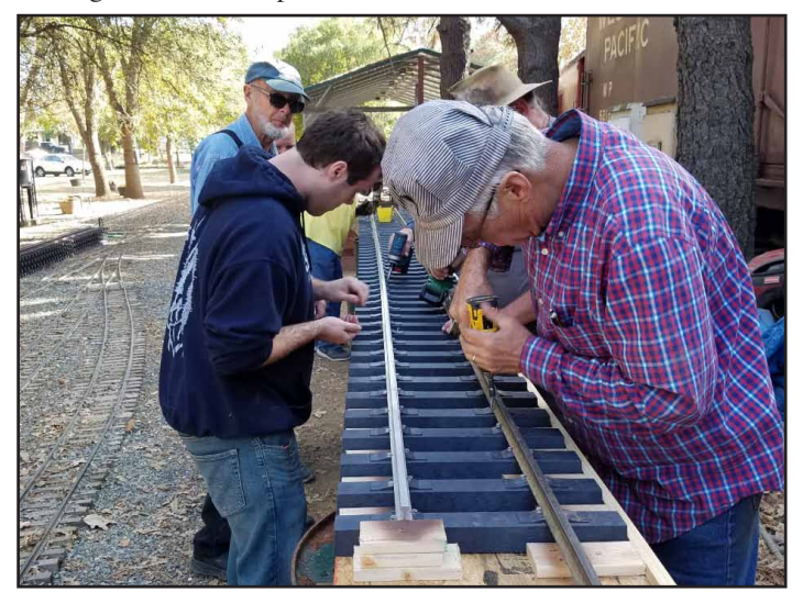
Track panel building for the inside loop project.

Merry Christmas, hope to see you on New Year's Day for running trains and the pot luck.