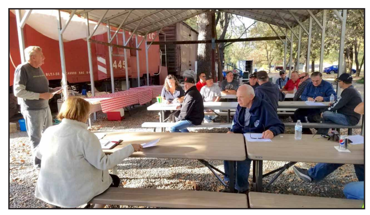
General Meeting November. Elections, Discussion on projects, and the upcoming events and need for volunteers.

We'll need help setting up beginning December 4th, plus lots of help the on the following two weekends. Then there's cookies! I had no idea how many cookies we serve over the course of two weekends, it's in the thousands! So, we're hoping that folks will jump in and help out. It's a lot of work, but it's hectic crazy fun at the same time! With that thought in mind, we'll probably be calling folks to see if they're willing to jump in and help out. If you can assist us, so much the better! After all that craziness subsides, we'll concentrate on track improvements for the next season. Rest assured, there's gonna be some really neat changes and improvements over the next few months. Heck, come on out and join in there too. That's all for now. Please think about how you might be able to help out, as we'd love to see you out there! Until then, hope to see you on the rails!