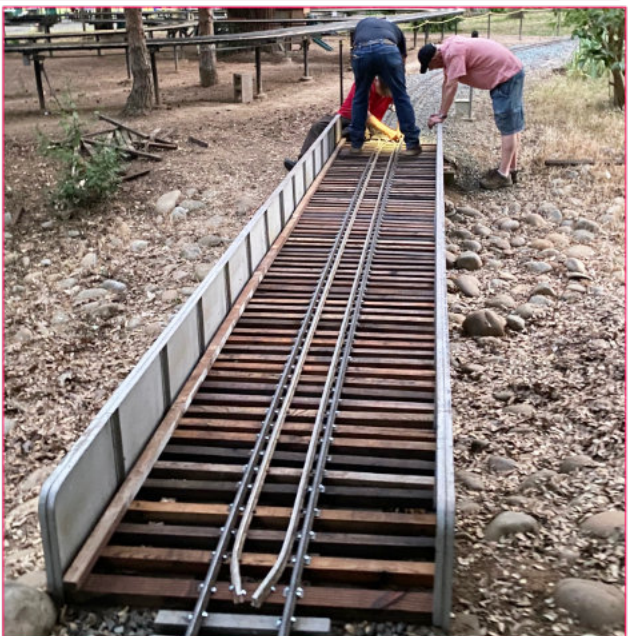
Completed project of tie replacement on the girder bridge.