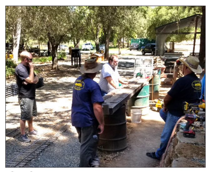
SVLS members thinking about working on track panels.