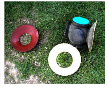
The RGS Story (Rio Grande Southern) Complete set Vols I-XII $1500.

Full Size Crossing lights & bracket (2 light) $275. Full Size single Crossing light $100. Full size Adlake Switch Stand light $175. Full size Adlake switch light has only one lens $100.