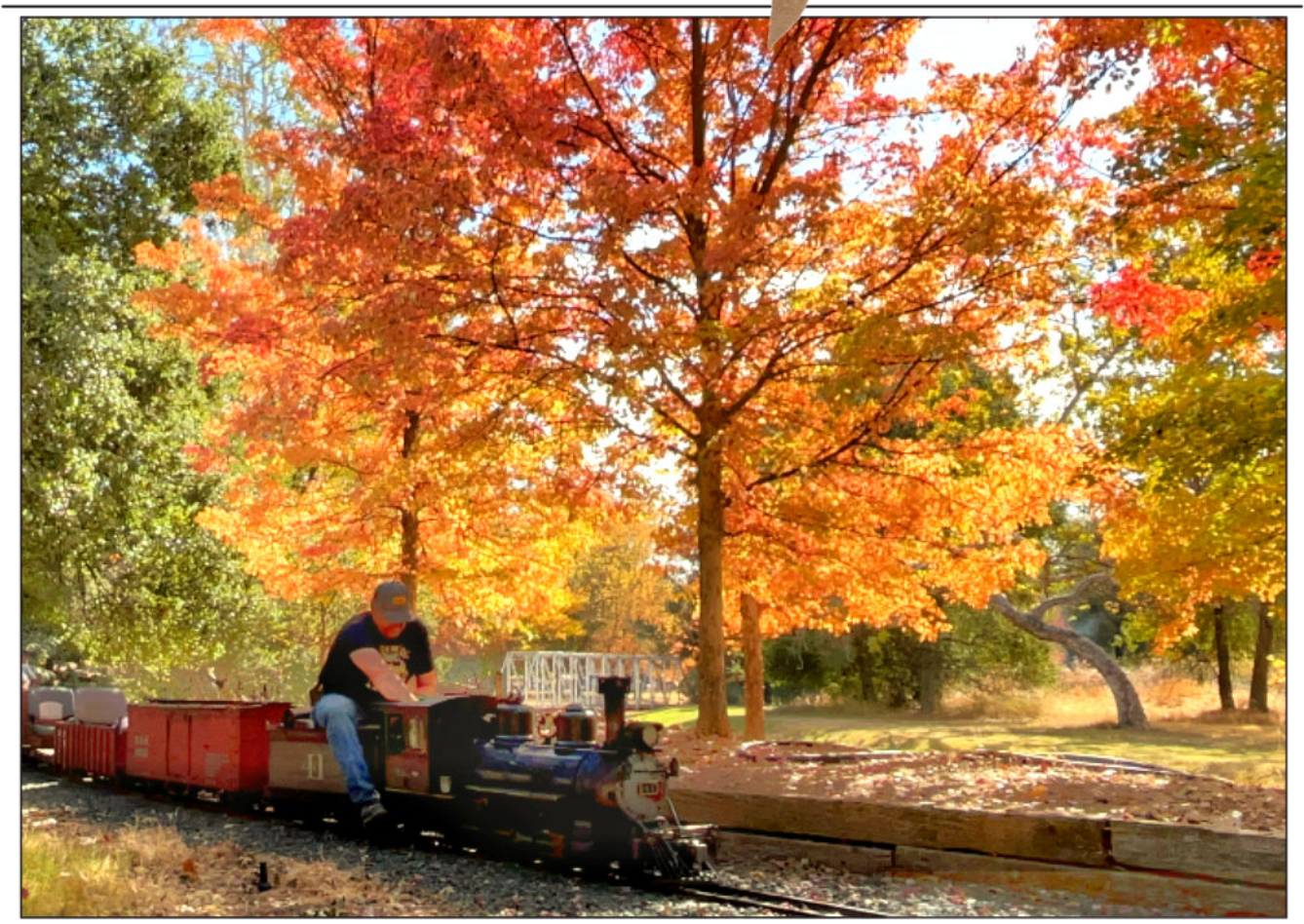
It was really a FALL MEET, Trains running on our mile of track through the woods and seeing the the full color of the trees and enjoying the day.