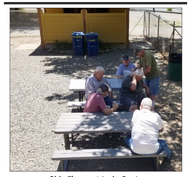
Old Timers Work Party

Reminder please pull on locks after locking. I have shown up several times with the locks set to 0000 but not locked.