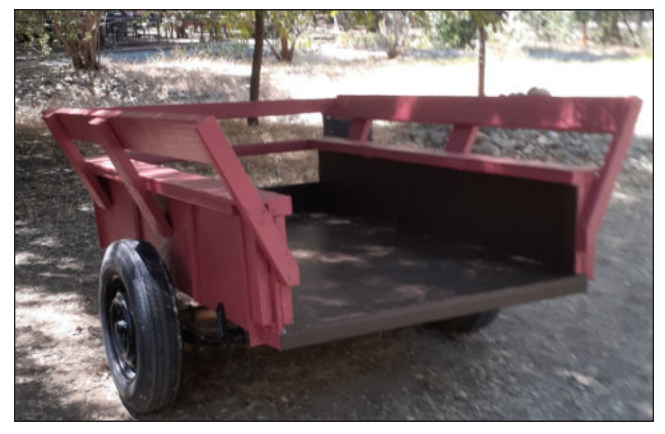
Trailer is ready for Halloween rides.