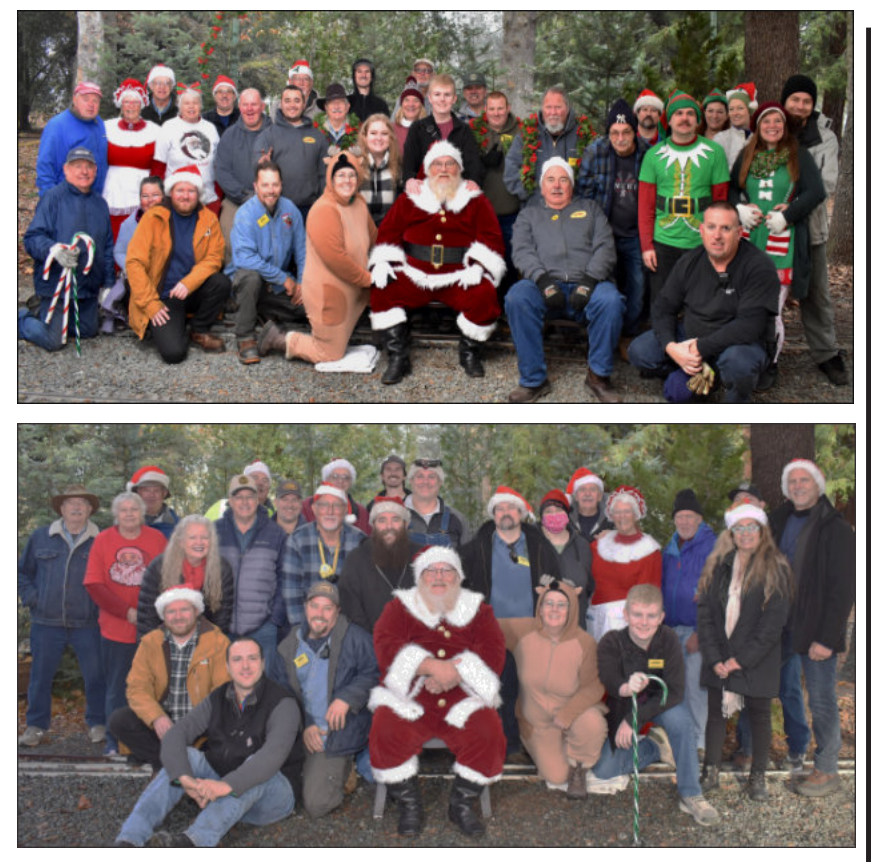
Thanks to all the people that made the Santa Run a success.