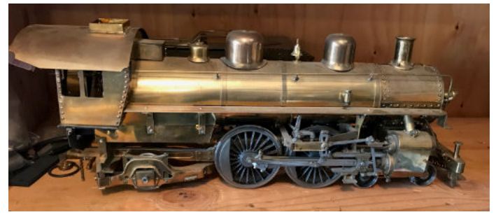
Item 3: 1 \frac{1}{2} inch Allen 2-6-0 Mogul and Tender $13,500.

Item 1: <sup>1</sup>/<sub>2</sub>" Brass Atlantic and Tender $2500.