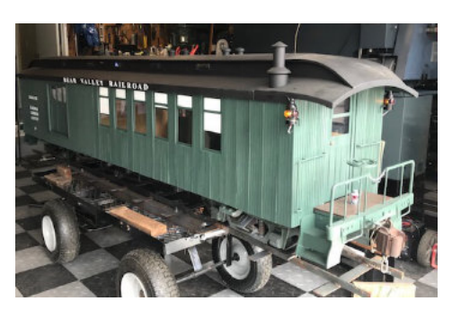
Look on line at more photos.

For SALE: contact Robert Morris Leave message at 925-240-9034