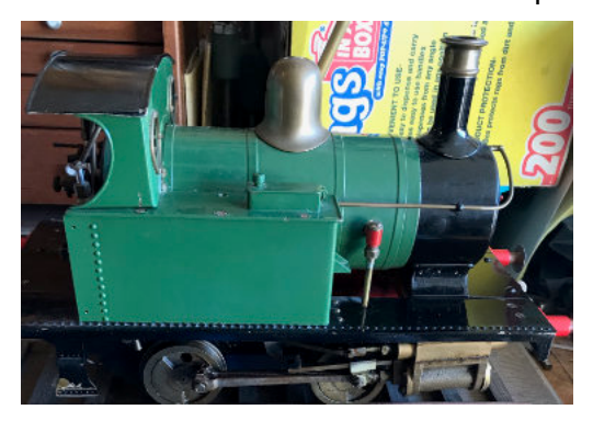
Item 3: 1 ½ inch Allen 2-6-0 Mogul and Tender $13,500.