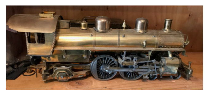
Item 2: 3/4" scale Tich 040 $1250.

Item 1: ½" Brass Atlantic and Tender $2500.