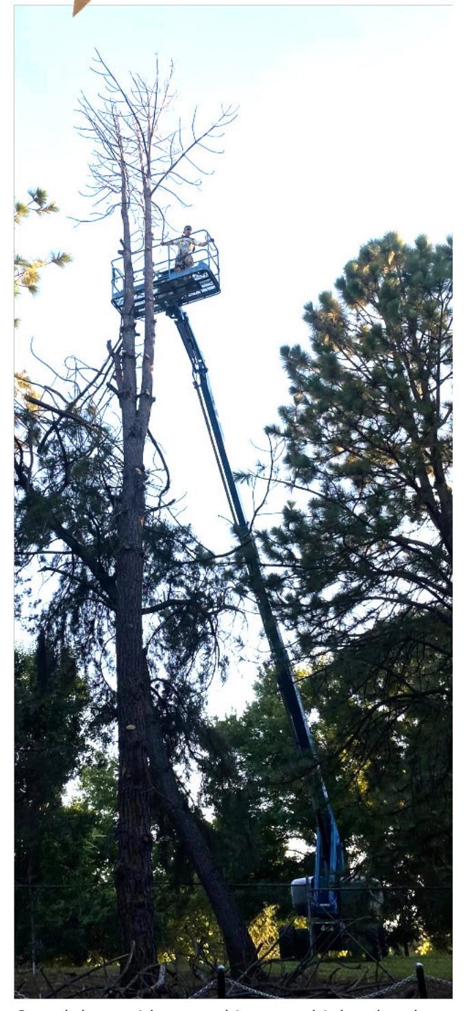
Our club president working at a higher level.