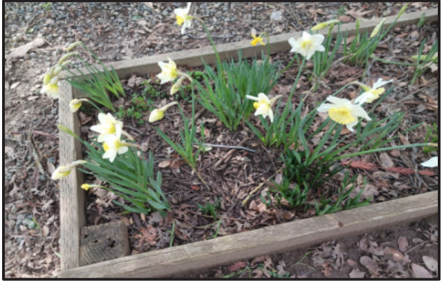
Daffodils are blooming

February was another busy month on the railroad with plenty of activity happening on a daily basis. General park maintenance as well as several