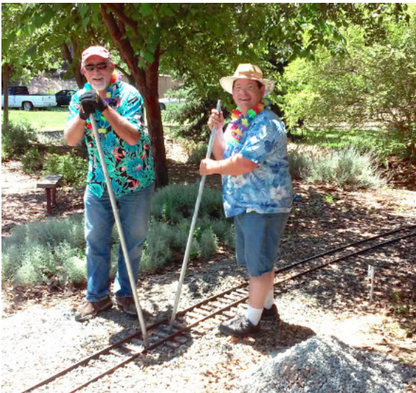
2015 Regional Spring Meet, Great fun!